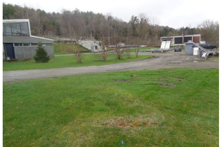
Proposed Location for New Headworks Building