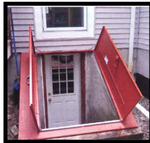
NFPA Life Safety Handbook Exhibit 24.5

The code requires that every sleeping room or living area must be provided with a secondary means of escape. This means at least one operable window or exterior door approved for emergency egress must be available in finished off basements. and ice.